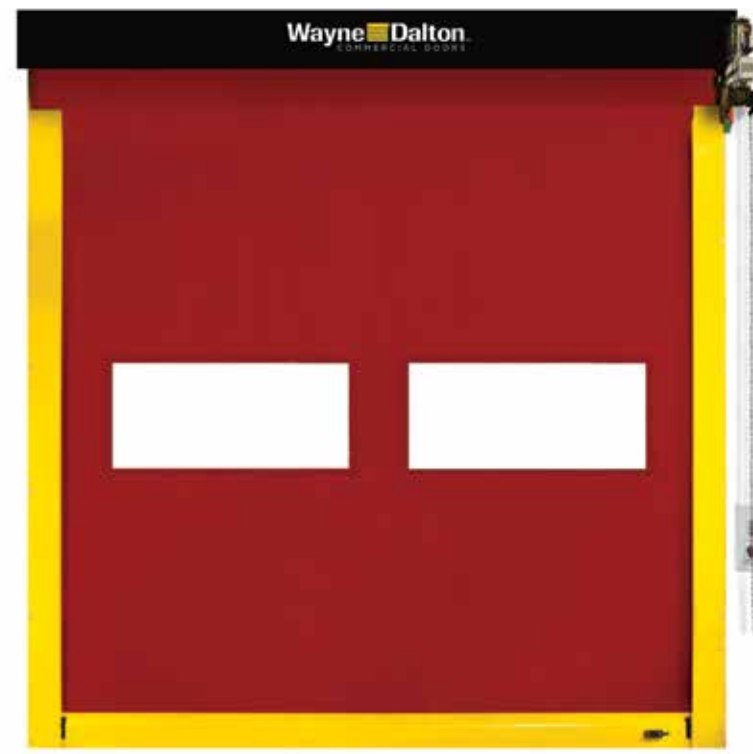
HIGH SPEED FABRIC DOOR MODEL 881 ADV-X