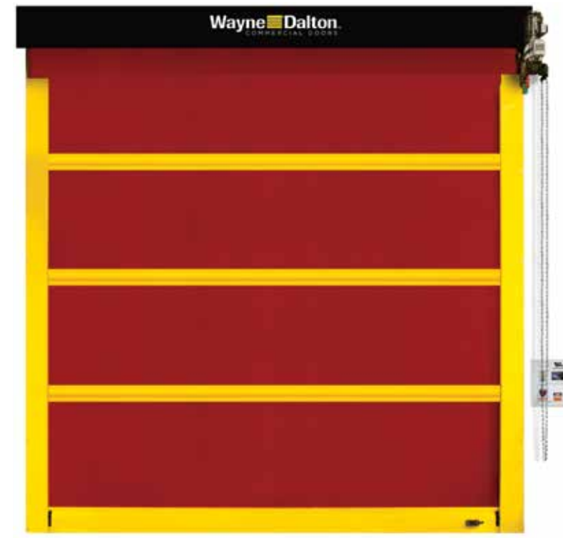
STRUTTED HIGH SPEED FABRIC DOOR MODEL 882 ADV-X