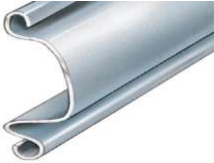
No. 4 Slat Profile