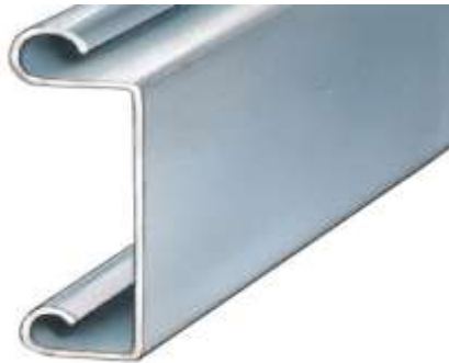
No. 14 Slat Profile