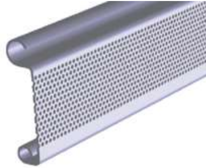
No. 14 Slat Profile – Secur-Vent®