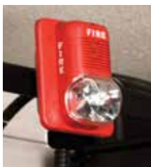
Horns and strobes