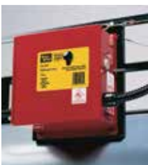
Waynegard™ Release Systems